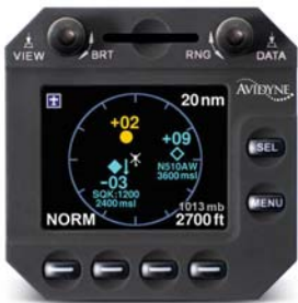
Avidyne MHD300 (optional)

The TAS600 Series provides three levels of alert, so pilots can monitor traffic before it ever becomes a threat. Each of these alerts also provides an altitude separation number and may also include an Arrow pointing up or down denoting that the target is climbing or descending at a rate of 500 feet per minute or greater.