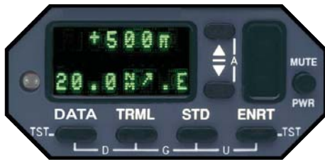
Avidyne ATD150 (optional)

Avidyne's ATD150 'half 3-ATI' Digital Display provides control and display functionality that can be used independently or with a multifunction display. The ATD150 adds a built-in Mute/Update, Approach Mode switch, and an Altitude Alerter function, and provides a compact alternative for displaying traffic threats when panel space is at a premium.