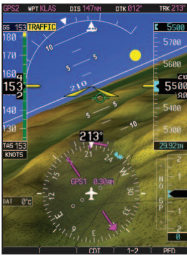
With Garmin's SVT-capable flight displays (sold separately), traffic can be depicted in a 3-D format. As targets get closer, the symbols get larger.