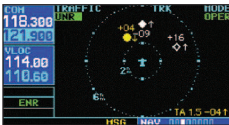
GTS 800 series traffic alerts can be displayed on Garmin's popular 400W and 500W series navigators.